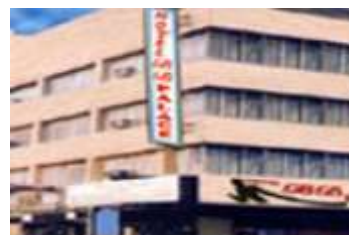
Hotel BB Palace, Delhi